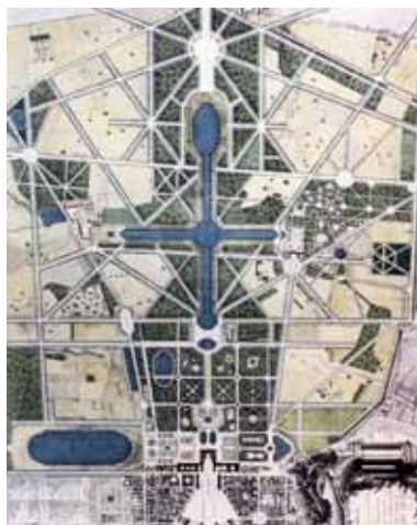
Map of Versailles, the Little Park and its outbuildings, Abbé Delagrive, 1746

COLAS, A PARTNER OF THE PALACE OF VERSAILLES for the rehabilitation of the park's avenues and terraces, is donating its skills for the redevelopment of the Etoile Royale's avenues and roads (re-establishment of a circular road around the central esplanade and creation of sandy side lanes).