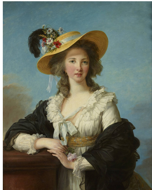
Yolande-Martine-Gabrielle de Polastron, Duchess of Polignac , Élisabeth Vigée Le Brun, 1782, oil on canvas