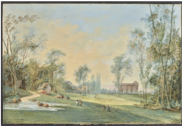
The borders of the Bagatelle pavilion , Louis Belanger, 1785, gouache on vellum

In spring 2026, Gardens of Enlightenment (1750–1800) will open, a major exhibition bringing together nearly 150 works — paintings, drawings, furniture, architectural projects and costumes — to reveal the originality and diversity of landscaped gardens designed in the second half of the eighteenth century. Inspired by a model that emerged in Great Britain in the 1730s, this new style freed itself from the rules of the French formal garden, breaking with symmetry and geometric layouts in favour of irregularity, the picturesque and a poetic evocation of nature. From the middle of the century onwards, this aesthetic spread across northern Europe in a wave of Anglomania that combined eccentric garden follies, philosophical reverie, a taste for exoticism and the search for an intimate refuge. The exhibition explores its many sources — from Antiquity to China — as well as the new ways of life it accompanied, oscillating between rural pleasures, festivities and contemplation. The exhibition route will engage in close dialogue with the historic gardens of the Trianon estate, offering a new perspective on the elements of its English garden: the Belvedere, the Temple of Love and the Queen's Hamlet.