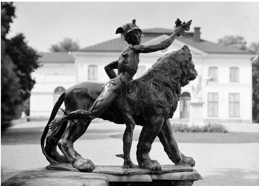
Adriaen De Vries, Mercury Crowning a Lion (detail), 16th–17th century

Christophe Leribault, President of the Château de Versailles