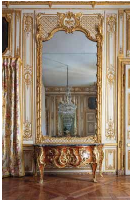
The Gaudreaus commode, temporarily reinstated in its original position in 2022

By the end of the reign, the value of these furnishings reached exceptional levels: the gilt-bronze girandoles alone were estimated at over 100,000 livres. More than a simple bedchamber, this room emerges as a powerful expression of eighteenth-century royal luxury, where fine furniture, horology, and goldsmith's work interact to assert both the power and the taste of the King.