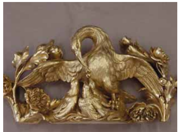
The different stages in the gilding of the pelican on the canopy of the bed