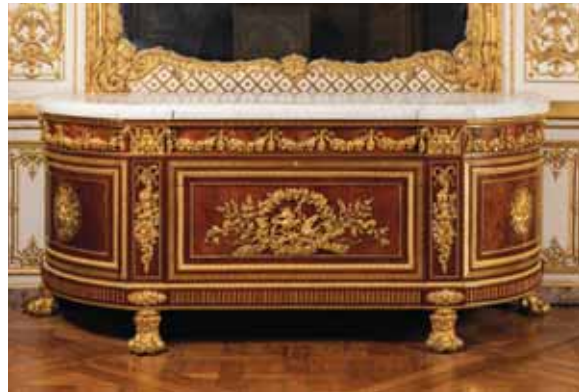
The commode by Joseph Stöckel and Guillaume Benneman, originally supplied for the King's bedchamber at Compiègne