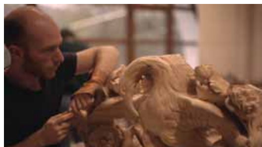
Château de Versailles / T. Garnier