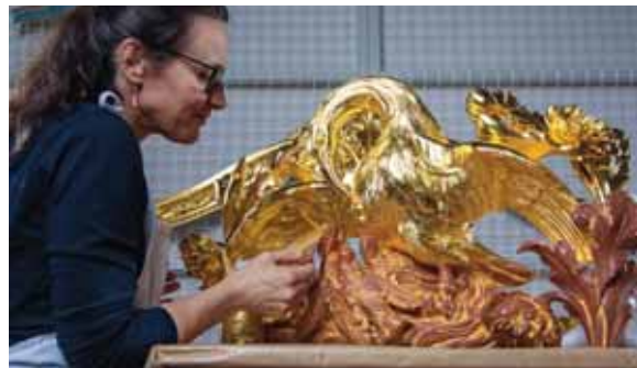
Château de Versailles / D. Sautnier