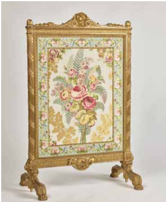
The fire screen by Jean-Baptiste Séné, originally supplied for the King's bedchamber at Saint-Cloud

The room is thus a recomposed space, made up of elements that did not originally belong to it. Yet through meticulous research, careful selection, and thoughtful integration, Versailles offers the most accurate and coherent vision possible of a royal interior on the eve of the Revolution. The aim is not merely to reconstruct a décor, but to evoke the atmosphere of life at the Château de Versailles at the end of the Ancien Régime.