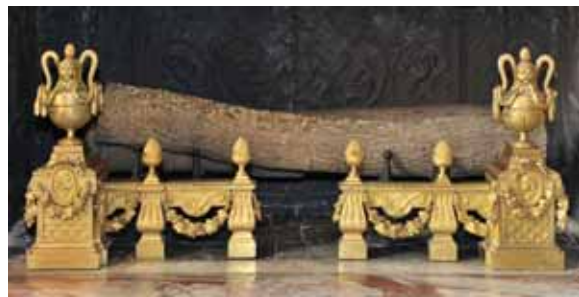
The pair of firedogs originally supplied for the King's bedchamber at Compiègne