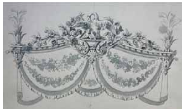
Preparatory watercolour for the canopy © François Gilles

Carried out in close collaboration with the curatorial team, this reconstruction reflects a determination to restore the room to its original appearance. As the last bed installed before the Revolution, it now re-establishes the historical coherence of the chamber, restoring the richness of a lost royal furnishing. By its scale, its demands, and its unprecedented nature, this project demonstrates the capacity of the Château de Versailles to undertake restoration campaigns of exceptional ambition, in the service of heritage made accessible to all.