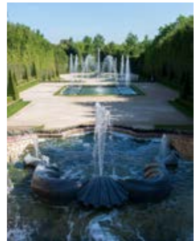
The Grove of the Three Fountains, restored thanks to the patronage of the American Friends of Versailles in 2000

One of the channels through which the United States shows its attachment to Versailles is its support. In fact, American philanthropists are among the most numerous and benevolent donors to the Palace of Versailles. To commemorate this special relationship, the Versailles Award