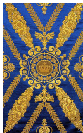
Silk , Grand Frères, Author of the work, Alexandre-Théodore Brongniart (1739–1813), Author of the model © Mobilier national, Isabelle Bideau

Finally, the tour of the Emperor's apartment at the Grand Trianon will be included in the exhibition's itinerary on an exceptional basis. Samples of the original Lyon fabrics will be compared with textile restorations.