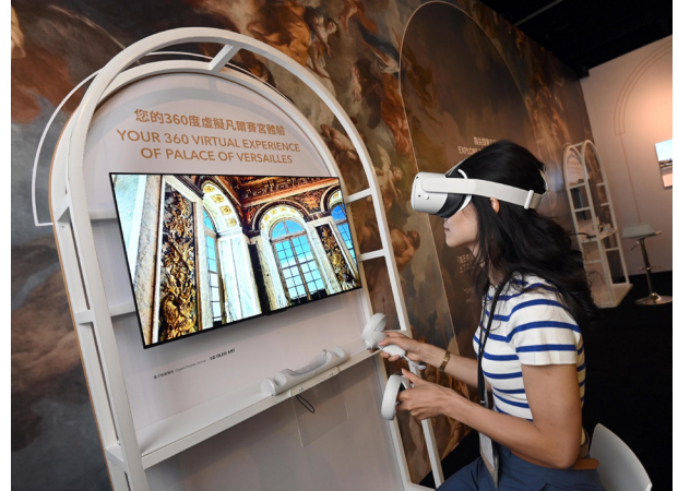
Virtually Versailles in Macao in 2013

In Hangzhou, the exhibition will be held at the Winland Center, at the heart of one of the city's historic districts. On this occasion, 56 musicians from the Royal Opera Orchestra of Versailles will perform a concert at the opening of the exhibition.