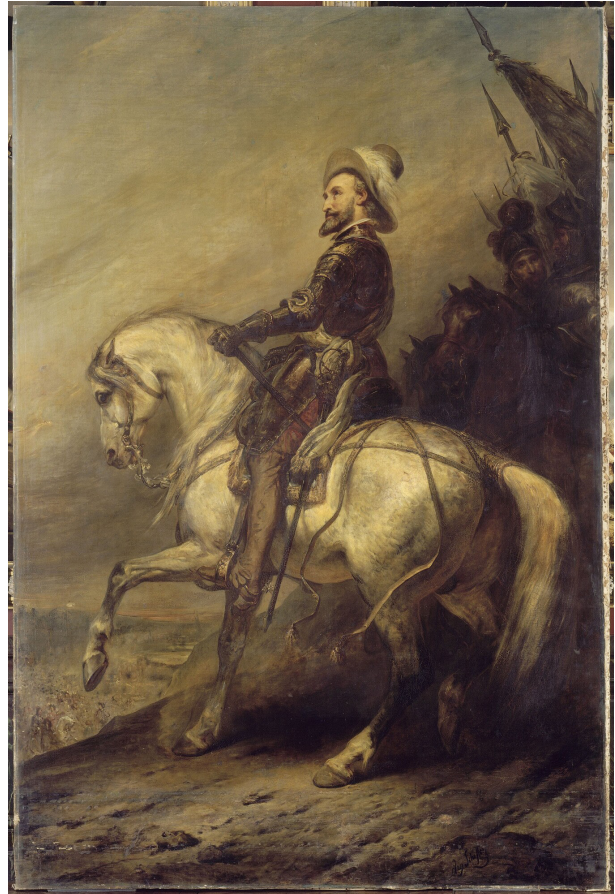
Equestrian portrait of Henri IV, King of France, Ary Scheffer (1795-1858), 1828, Palace of Versailles