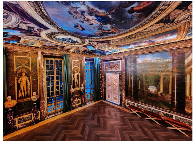
Virtually Versailles in Hong Kong in 2013