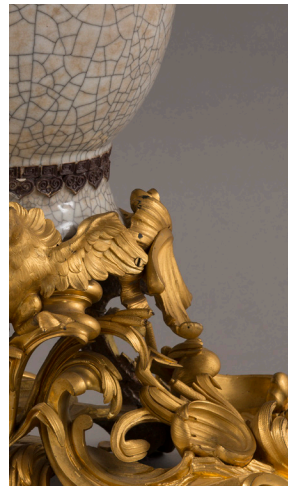
Chinese porcelain covered vase, 1736–1795, European gilded bronze mount, circa 1743

The exhibition in Beijing will bring together a selection of works from the Palace of Versailles and the Palace Museum that will more broadly testify to the veritable fascination felt by the court of Versailles and by the great French lovers of China's cultural exports. It reveals the efforts and achievements of China and France to achieve mutual understanding and cultural exchanges in the 18th century and vividly reconstitutes the cultural and artistic exchanges between the two countries.