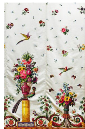
Silk , Bissardon, Cousin and Bony (active in the early 19th century), © Mobilier national, Isabelle Bideau