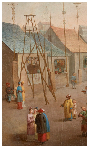
The Nanjing city fair, Marie Leszczyńska (1703–1768), 1761, Palace of Versailles