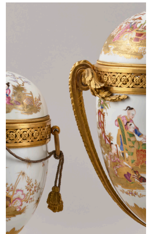
Set of three "Chinese" vases sold to Queen Marie-Antoinette between 1774 and 1776, Manufacture de Sèvres, Palace of Versailles