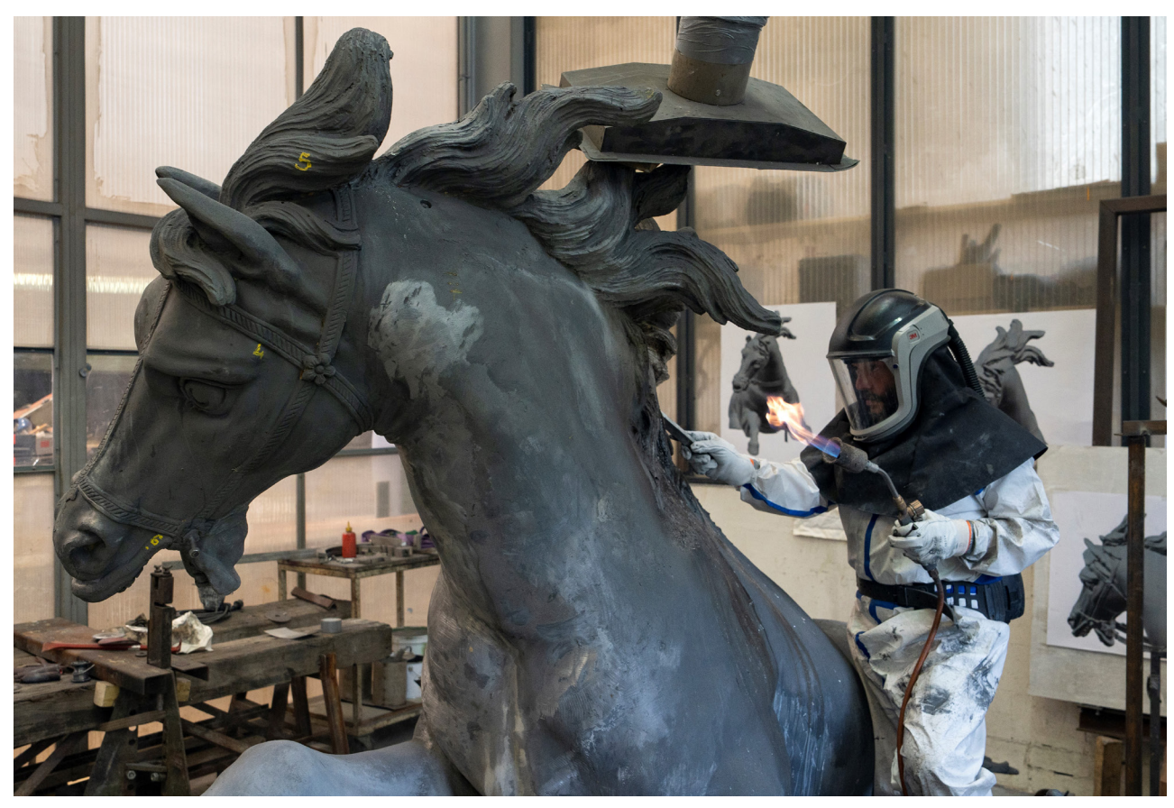
One of the lead horse sculptures of Apollo's Chariot undergoing restoration at the Coubertin Foundry