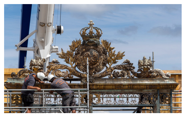
Removal of the Honour Gate

The Palace of Versailles is currently restoring the Honour Gate, the main entrance to the Estate, along with the two sculpted groups by Girardon and Massy that frame it. Thanks to funding from the Departement des Yvelines, this operation will restore the original layout of the gate and its ornamentations existing since the 19th century. The scaffolding, installed in September 2023, will remain in place until spring 2024, when the restored Honour Gate will be unveiled to the public.