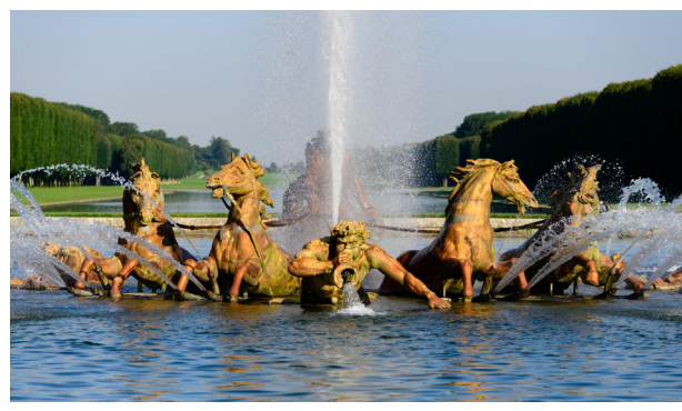
The Basin of Apollo's Chariot before restoration

The Apollo's Chariot Basin will be fully reopened in April 2024 for the Grandes Eaux, following an exceptional restoration that has involved various skilled trades such as art foundry, metallurgy, gilding, fountain artisanship, and masonry.