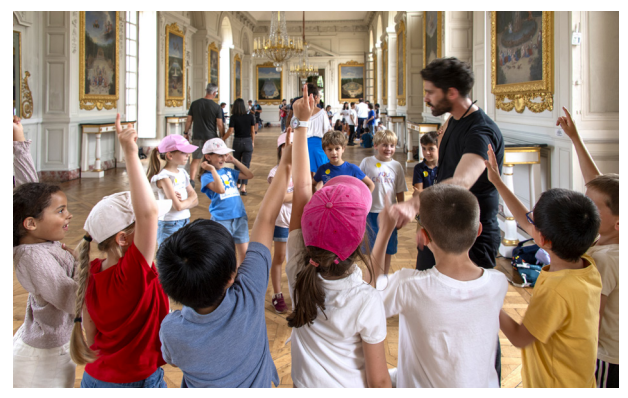
A Pentathlon of the Arts workshop at the Grand Trianor

In 2023-2024, the Palace of Versailles will offer Pentathlon of the Arts workshops for school pupils and people with limited access to culture. Conducted in partnership with the Academy of Versailles, the "À l'école du patrimoine et de la création : des corps et des muses " programme involving nearly 2,000 pupils will also draw from this programme.