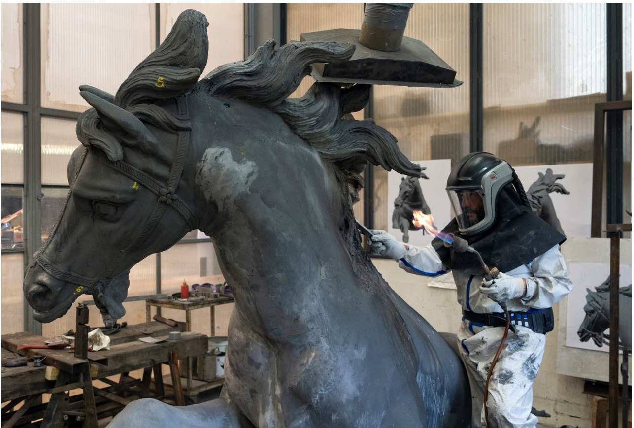
One of the lead horse sculptures of Apollo's Chariot undergoing restoration at the Coubertin Foundry