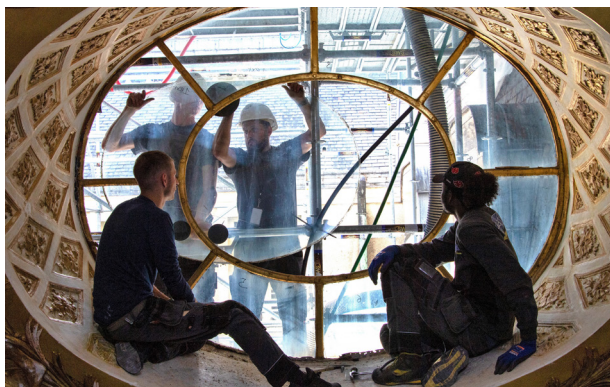
Removal of the Œil-de-Bœuf

Emblematic of life at the court during the reign of Louis XIV, the Œil-de-Bœuf Antechamber is undergoing extensive restoration. This operation will breathe new life into the woodwork, gilding, and painted decor of this masterpiece of decorative arts. The Palace is also bringing the King's Apartment, where the famous King's Chamber is located, into compliance. Both will reopen to the public in June 2024.