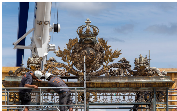
Removal of the Honour Gate

The Palace of Versailles is currently restoring the Honour Gate, the main entrance to the Estate, along with the two sculpted groups by Girardon and Massy that frame it. Thanks to funding from the Département des Yvelines, this operation will restore the original layout of the gate and its ornamental details existing since the 19th century. The scaffolding, installed in September 2023, will remain in place until spring 2024, when the restored Honour Gate will be unveiled to the public.