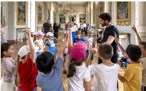
A Pentathlon of the Arts workshop at the Grand Trianon

In 2023-2024, the Palace of Versailles will offer Pentathlon of the Arts workshops for school pupils and people with limited access to culture. Conducted in partnership with the Academy of Versailles, the "À l'école du patrimoine et de la création : des corps et des muses" programme involving nearly 2,000 pupils will also draw from this programme.