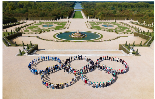
400 young people celebrate the Olympic rings at the Palace of Versailles