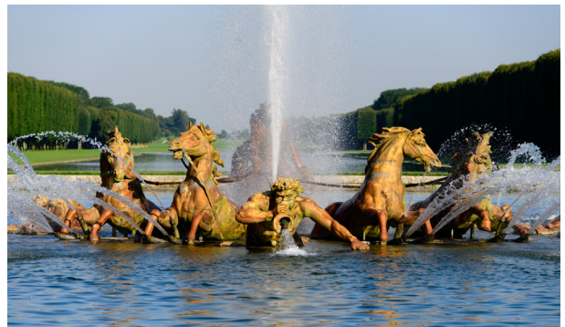
The Basin of Apollo's Chariot before restoration

The Apollo's Chariot Basin will be fully reopened in April 2024 for the Grandes Eaux, following an exceptional restoration that has involved various skilled trades such as art foundry, metallurgy, gilding, fountain artisanship, and masonry.