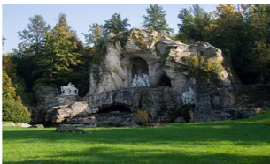
Apollo's baths grove