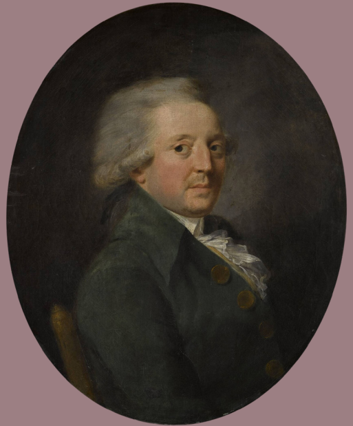
Anonyme, Nicolas de Condorcet, 1779-1793 Oil on canvas, H. : 72,5 ; W. : 59,2 cm