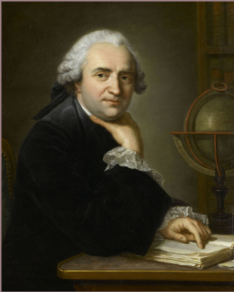
Anonyme, Jean-Baptiste Bourguignon d'Anville, geographer, 18 e century Oil on canvas H. : 81,3 ; W. : 64,8 cm