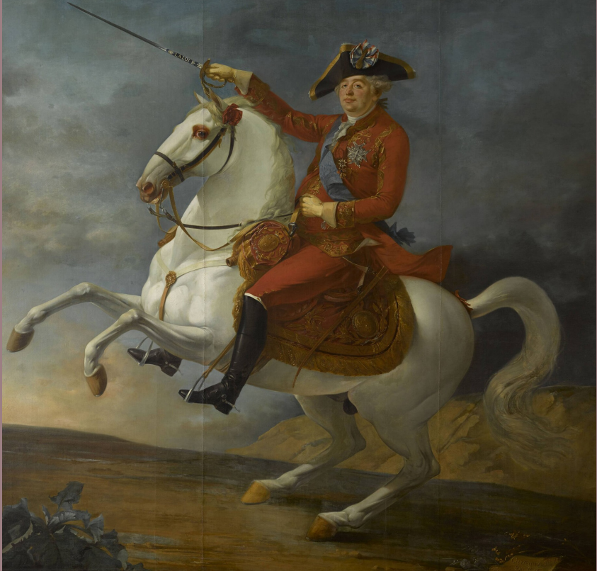
Jean-Baptiste Carpeaux Louis XVI, King of France (1754-1793) , 1791, Oil on canvas, H. : 310; W. : 324 cm

This final official portrait of Louis XVI (1791–1792) depicts him as a constitutional monarch. It will be displayed opposite Serment du Jeu de Paume [The Tennis Court Oath] by Jacques-Louis David. Created at a time when royal authority had not yet been fully challenged, this equestrian portrait presents the sovereign as the embodiment of a new political order.